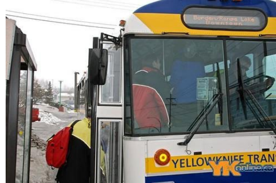
City of Yellowknife Transit